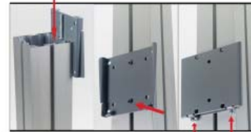
Slide Mount into Groove of Vertical Extrusion. Tighten Setscrew Attach top Plate and tighten screws